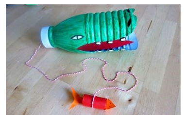
DIY Cup and Ball Game www.kiddiepop.com