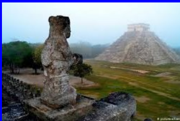
The famous pyramid of Kukulcan