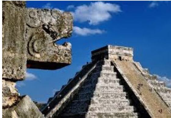
El Castillo (the castle)

Ancient gods, sacred rituals and 365 stone steps, all within the awesome temple known as 'The Castle', explore an insanely high pyramid at 23 metres tall, until the sun goes down... but watch out for the shadow of the slithering serpent. Find out how they worshipped the ancient god - Kukulcan, the feathered serpent. The stunning El Castillo will take your breath away as you watch the legend of the 'descent of Kukulcan' unfold before your very eyes and this mysterious wonder of the world takes you back in time to 1500 years ago!